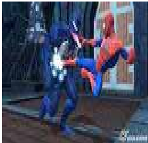
Game Review Spider-man: Friend or Foe